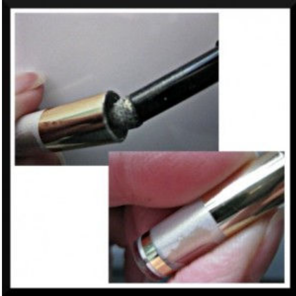
Eye Shadow cap with the little pot of glimmery colour!