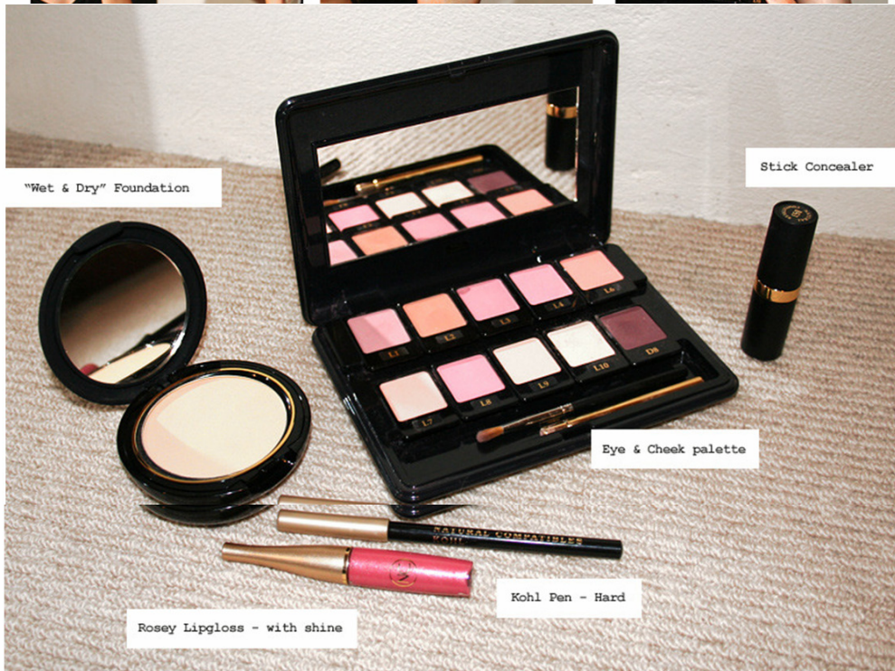
As my inspiration I used an image from Versace 2010